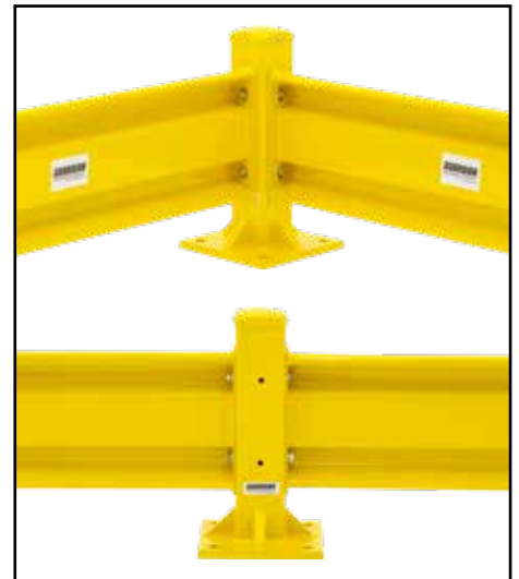
Corner or Straight Configuration

Step 4. After installing the rails, securely tighten the concrete anchors with an impact wrench.