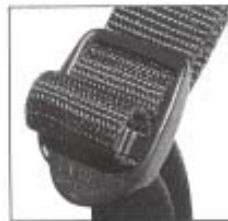
How to thread a ladder lock